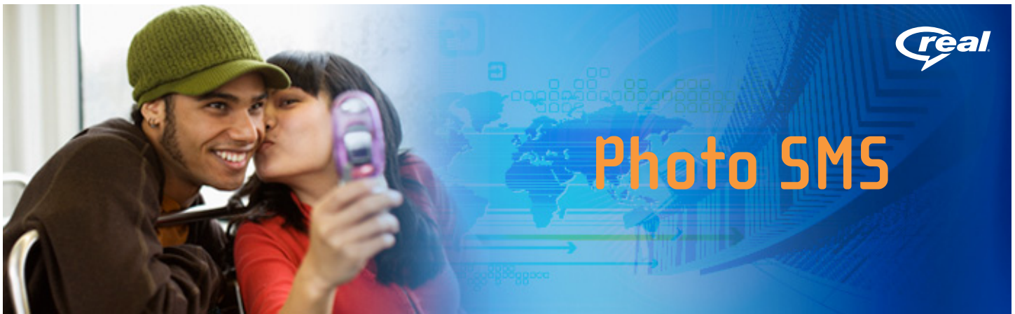
Photo SMS is an easy, fun way for users to personalize their messages by combining SMS text with pre-selected photos or images into an MMS (multi-media message). It enhances simple text messaging by adding a visual aspect that makes messaging more personal, and expands the mobile service provider's portfolio.